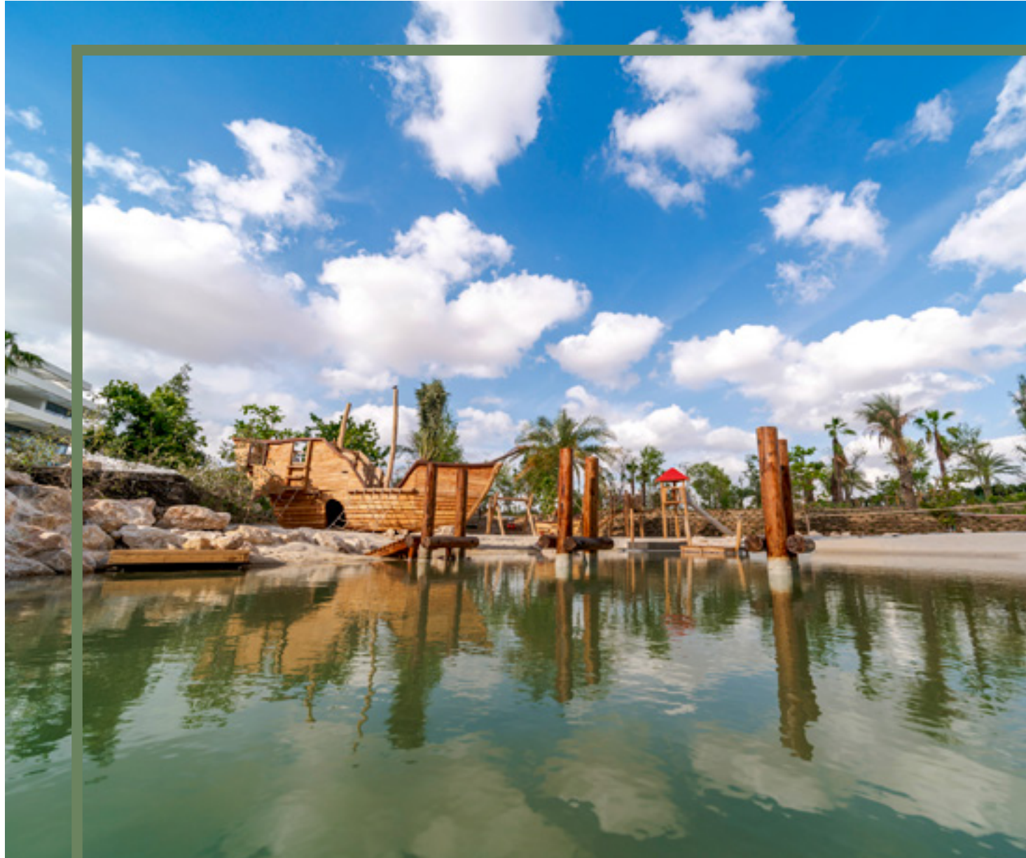
This bespoke pirate ship has been handcrafted from oak with pulley systems on board that allow children to interact and work in teams

Thoughtful design fused with materials sourced with love